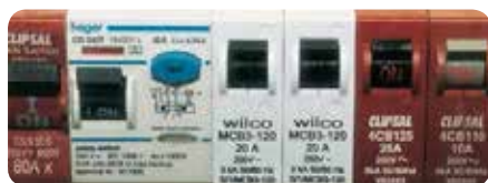
Image: Example of a switchboard with recommended safety devices

Look for a 'test' button on your switchboard or a button marked with a 'T', which will let you know you have an RCD installed. New homes built after 2000, renovated homes, rented or leased homes and homes recently purchased must have a residual current device installed. RCDs are sometimes confused with circuit breakers and surge protectors, but they are not the same thing. Generally, it will be labelled 'RCD', 'ELCB' or 'safety switch'.